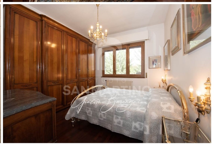
Annunci - 7