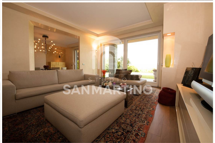
Annunci - 4