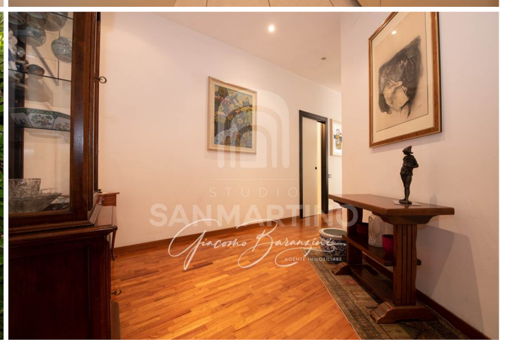
Annunci - 4