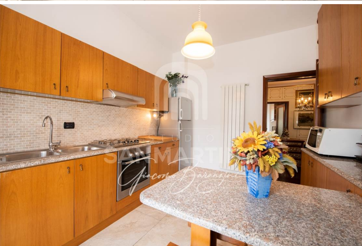
Annunci - 7