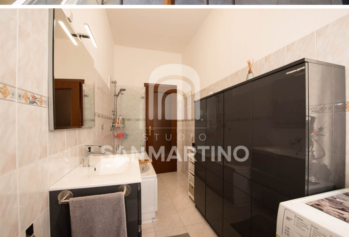
Annunci - 3