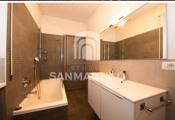
Annunci - 3