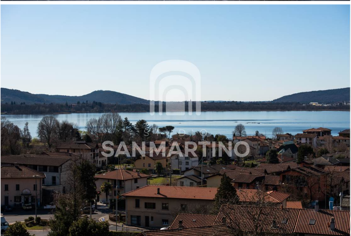
Annunci - 4