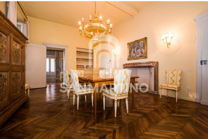
Annunci - 7