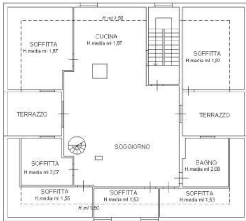
PIANO SECONDO H. ml 2,65