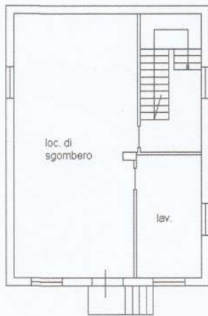
PIANO SEMINTERRATO H=2.50